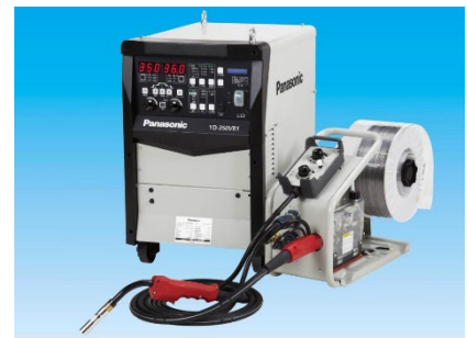
Welding Machine (Digital Controlled)