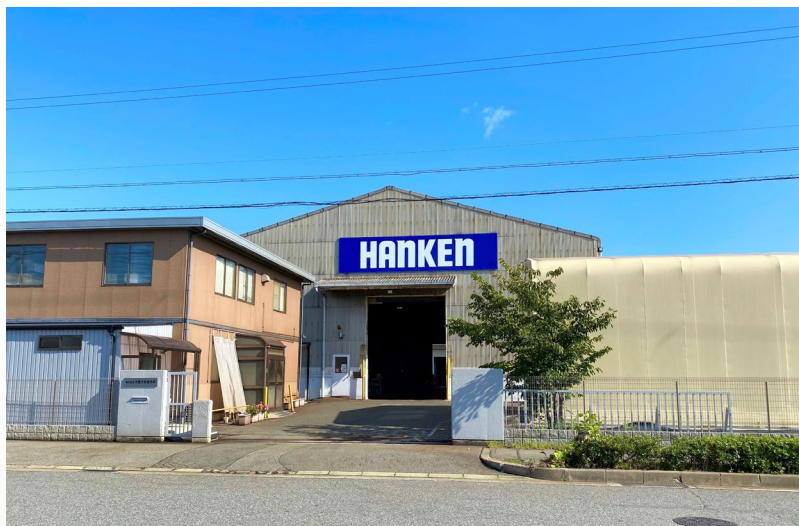
Head office and Factory (Akashi, Japan)