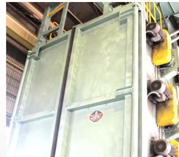
Shot Blast Machine