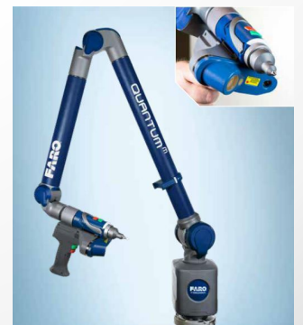
3D Measurement Instrument (FARO)