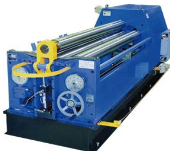
CNC Bending Roll