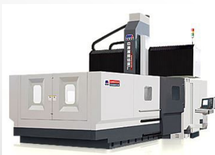
CNC Machining Center