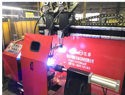
Automatic Welding Machine